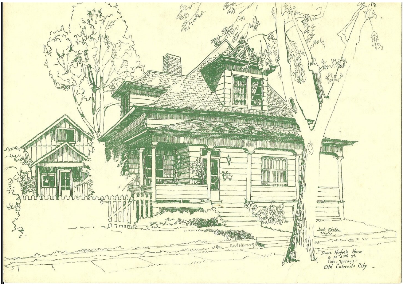
6 North 24th Street, and its accompanying 'Cottage' at 6 1/2 North 24th Street

While looking for a westside house to move into - partly to put my 'redevelopment money where my mouth was' - invest in the westside and not just lecture in, we found this 1900 'Georgian Revival' house, with an 1884 'Cottage' in the rear. The original owner's wife had the 'cottage' as a tack-house - two stories - which could house her horse and carriage. Years later when horses were passe, two rooms - kitchen and bath - were added on it and it became a rental cottage - or often called a 'mother-in-law' cottage with partial addresses ( 6 1/2) scattered throughout the westside.