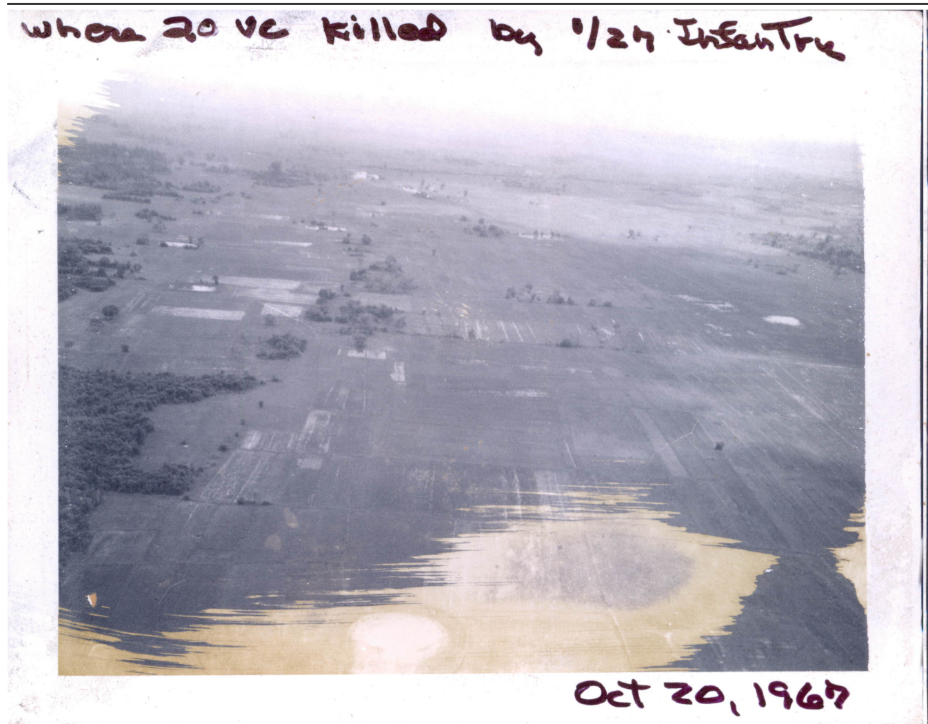
The Battle Field