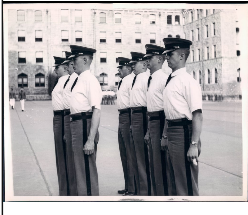
New Plebes on Day of Entry to West Point

But they try. Together with hammering away at how cadets stand – posture – the fit of their uniforms, the angle of their caps they get close. And the one major thing they can't control – height – they solved that for the first 150 years by 'sizing' all the cadets and assigning them to 24 100 man companies by height. So all four years I was to serve with 25 of my classmates in Company 'F-2' along with 25 plebes, 25 sophomores, 25 juniors, 25 seniors – all of whom were within a quarter inch in height of all others and me. And then the Companies ran from A-1 – the 'flankers', all well over 6 feet – to M-1, the 'runts' – the shortest cadets in