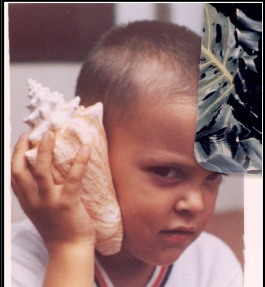
Listening to the world's sounds

But all good things come to an end. I was preparing to ask for a fourth year in Hawaii - which the usual rules would permit - but I was stunned to get the news I was selected to go for a year at the Command and General