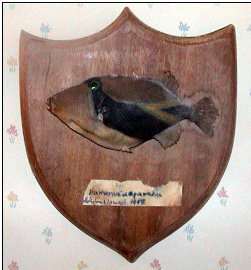
An Hawaiian waters humuhumunukunukuapua

Here is that mounted fish I speared 50 years ago