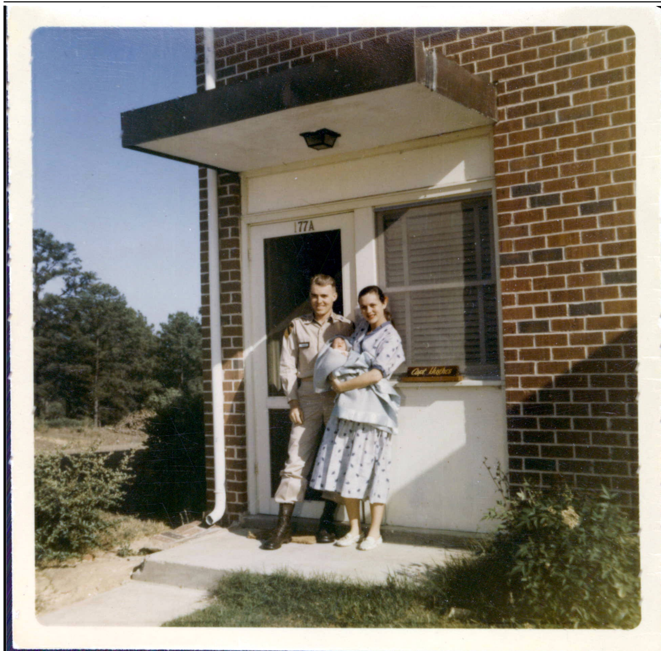
Before our Family Quarters at Fort Benning, 1954