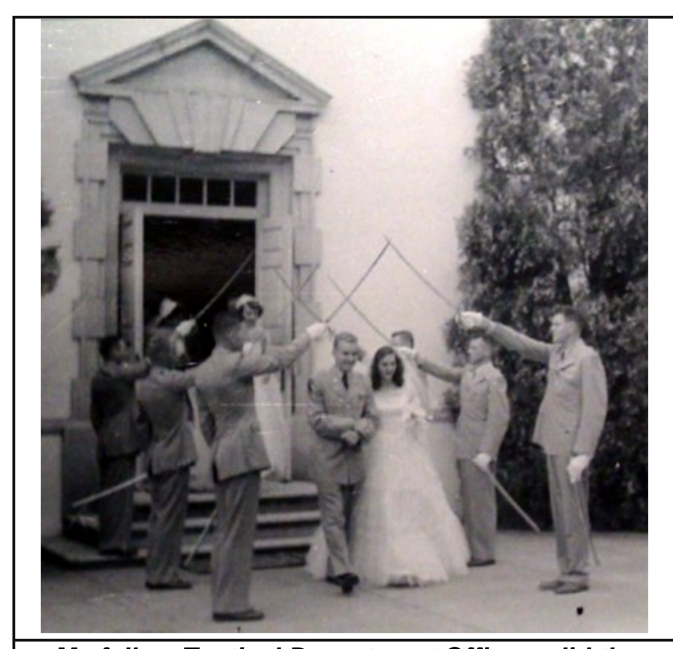
My fellow Tactical Department Officers did the Honors, with Sabers