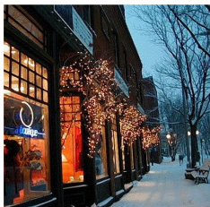
Historic District Merchants of Old Colorado City

Posted by Dave Hughes on December 4, 2009 at 10:00am View Blog