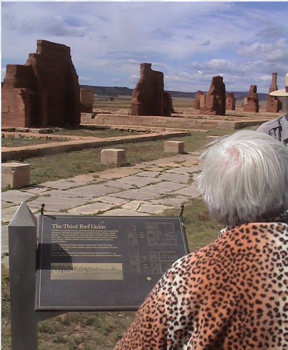
The remains of Fort Union - right astride the original Santa Fe Trail