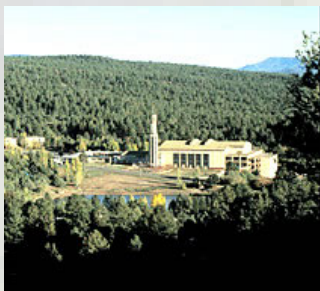
The open-to-all large Baptist Convention Center at Glorieta Pass on I-25