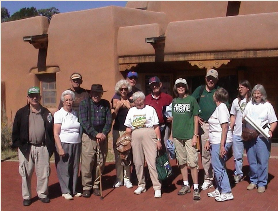
The whole Tour Group at Pecos National Historic Park Headquarters

The entire trip, van rental, gas, rooms and meals, from 8:30 AM Friday at the History Center through 5PM Saturday cost each of us just over $100. A great historical tour bargain! We will do something like that again!