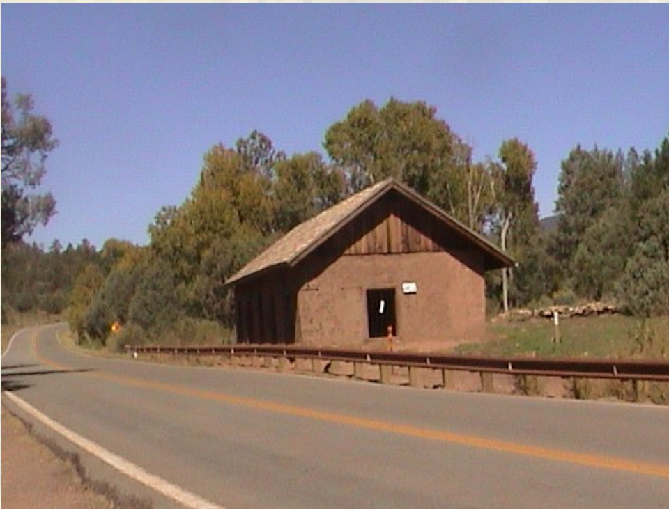
. The only surviving 1862 building at Pigeon's Ranch around which the main battle ranged, including an artillery duel - West Pointers against West Pointers