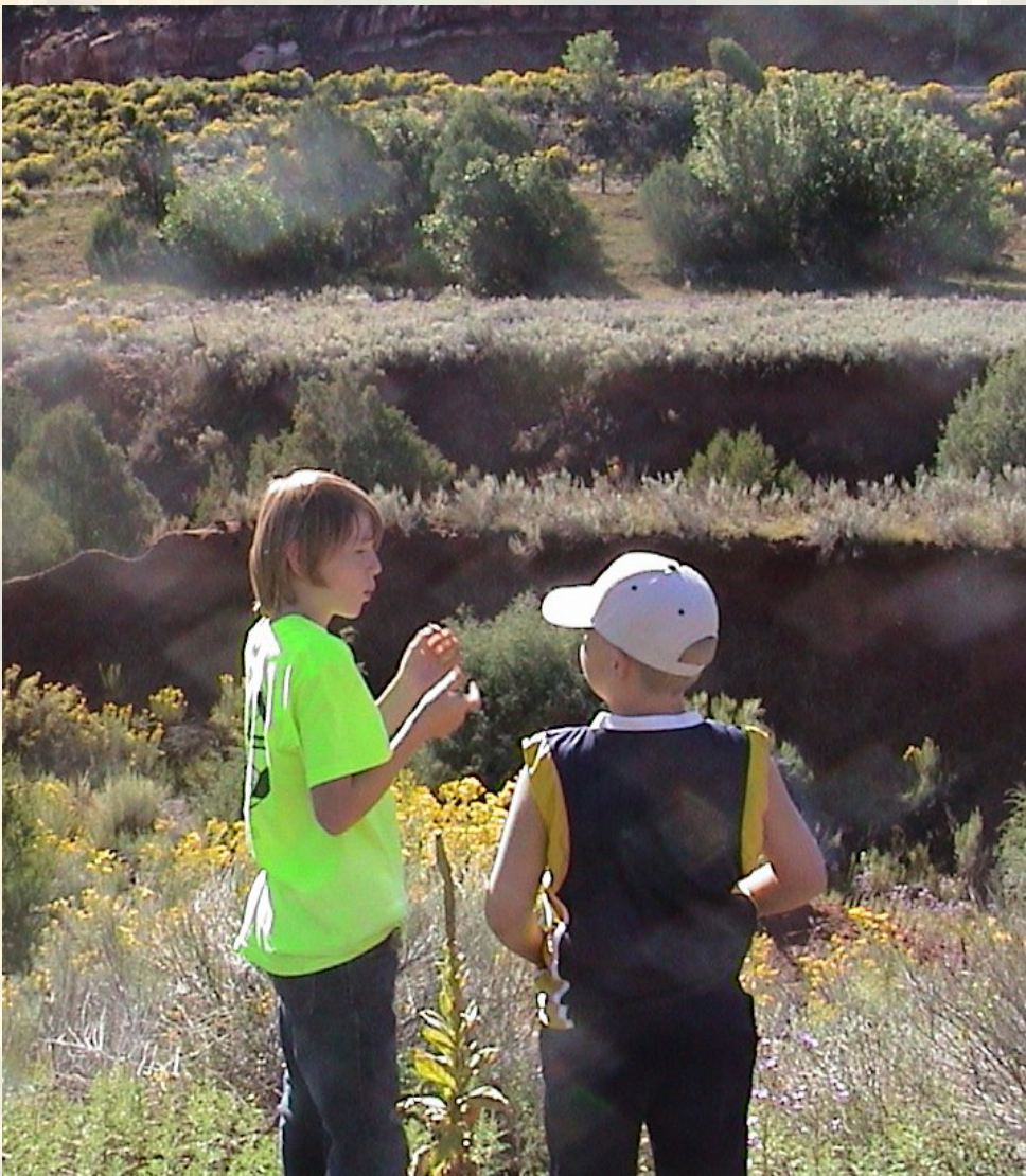
Two budding young historians above Apache Canon where Major Chivington surprised and overran the Texans on March 26th, 1862 and captured 80 of them,