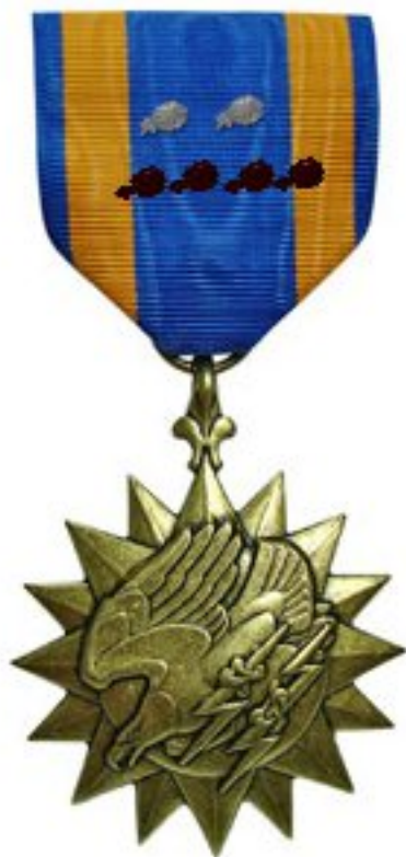
Air Medal with 2 Silver and 4 Bronze Star Clusters

One Air Medal is awarded for every 5 combat missions. This medal represents 70 Heliborne Combat Assaults where I was the Mission Commander. One Silver Oak Leaf Cluster equals 5 Bronze Oakleaf Clusters.